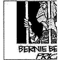
A roundup of ec