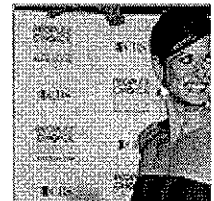
Celebrities, like D work the red carp