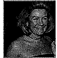
Best of Bill Bret Photos around t