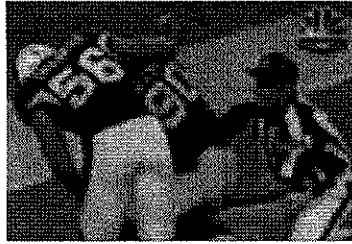
The Cardinals' "Excessively Gay Celebration"